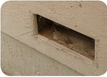
Before: Old Rusted Out Vents