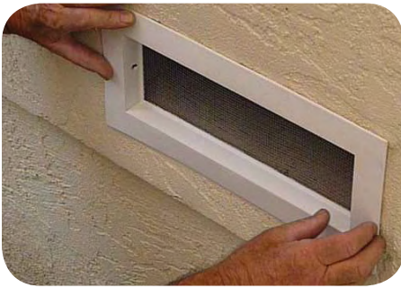
After: Installed EVRvent